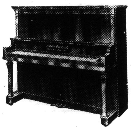
Style Colonial Regular $400. Club price $335