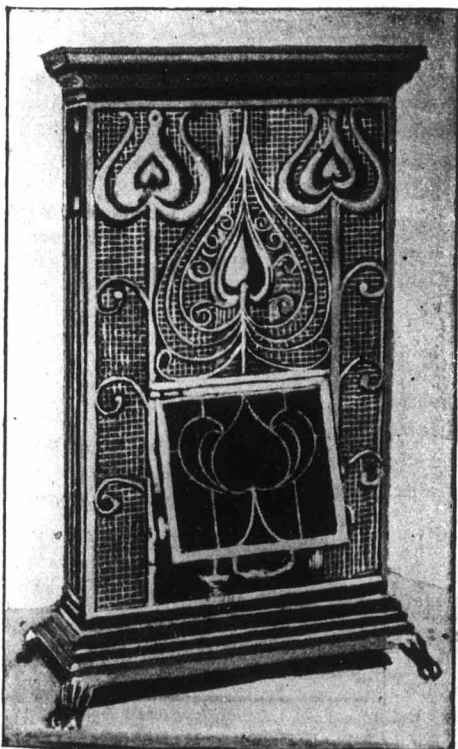
C 8. Inclusive Price, £12 12 C.