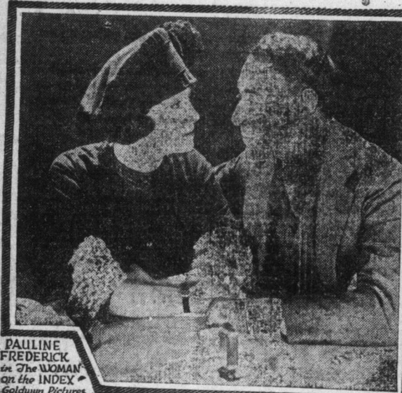
PAULINE FREDERICK in "The Woman on the Index" Goldwyn Pictures

Samuel Goldwyn presents Pauline FREDERICK in "The Woman on the Index"