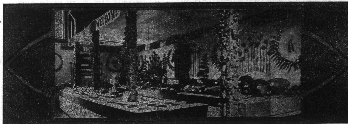
ONE OF THE DISTRICT EXHIBITS, 1906