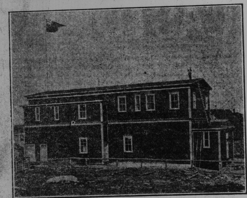
THE NEW ORANGE HALL AT MCADAM Built by Clarke Wallace Lodge, No. 72.