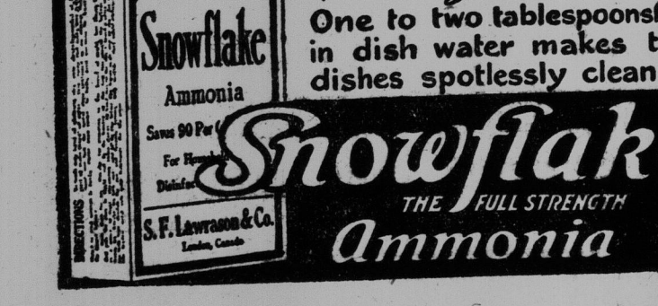
Snowflake Ammonia THE FULL STRENGTH Ammonia

DOMINION CORSET CO., Quebec, Montreal, Toronto Makers of La Dina and Goddess Corsets.