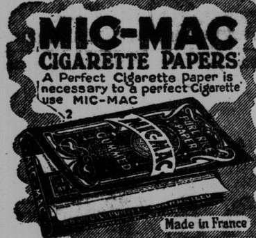
MIC-MAC CIGARETTE PAPERS A Perfect Cigarette Paper is necessary to a perfect cigarette. Use MIC-MAC Perfect Cigarette Paper.