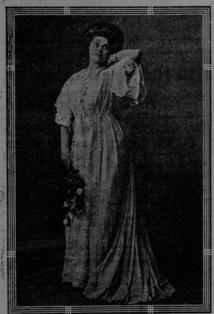
PRINCESS TEA GOWN WITH LINGERIE TRIMMINGS. Since the return to favor of the tea gown many new and novel effects have been shown in this class of garments...