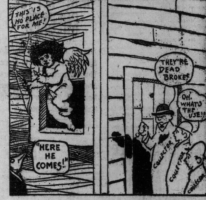
TORONTO WORLD PROVERB PICTURE NO. 10