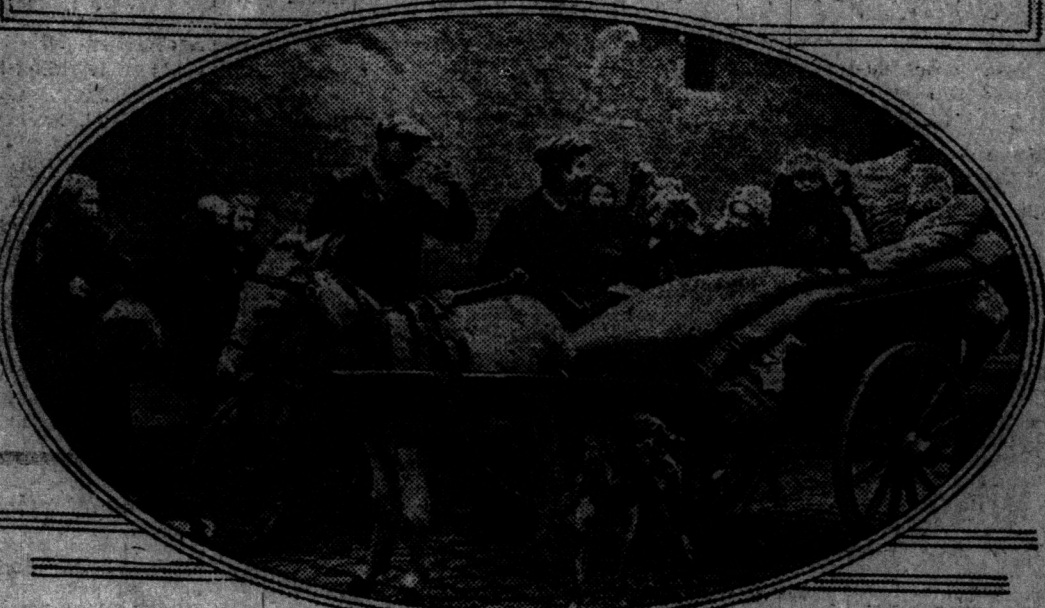
Children fleeing from Antwerp.