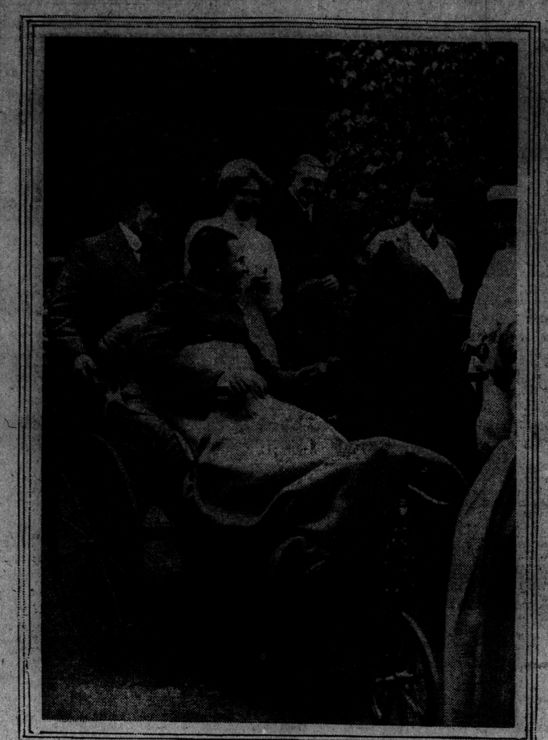
Empress Eugenie, who has converted her house at Farnboro, England, into a military hospital, making her daily round among the convalescents.