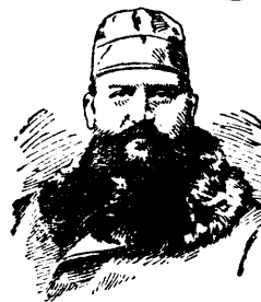
EX-MAYOR DANIEL F. BEATTY. From a Photograph taken in London, England, 1899.

Ex-Mayor Daniel F. Beatty, of Beatty's Celebrated Organs and Pianos, Washington, New Jersey, has returned home from an ex- tended tour of the world. Read his adver- tisement in this paper and send for catalogue.