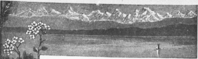
THE ALPS—FROM NEUCHATEL.