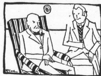
AN APT COMPARISON.

"Yes," replied Three-Finger Sam. "It's fur the perfection of home industry. We know all the bent corners an' finger marks by heart and any extra act that a tenderfoot tries to ring in is detected immediately."