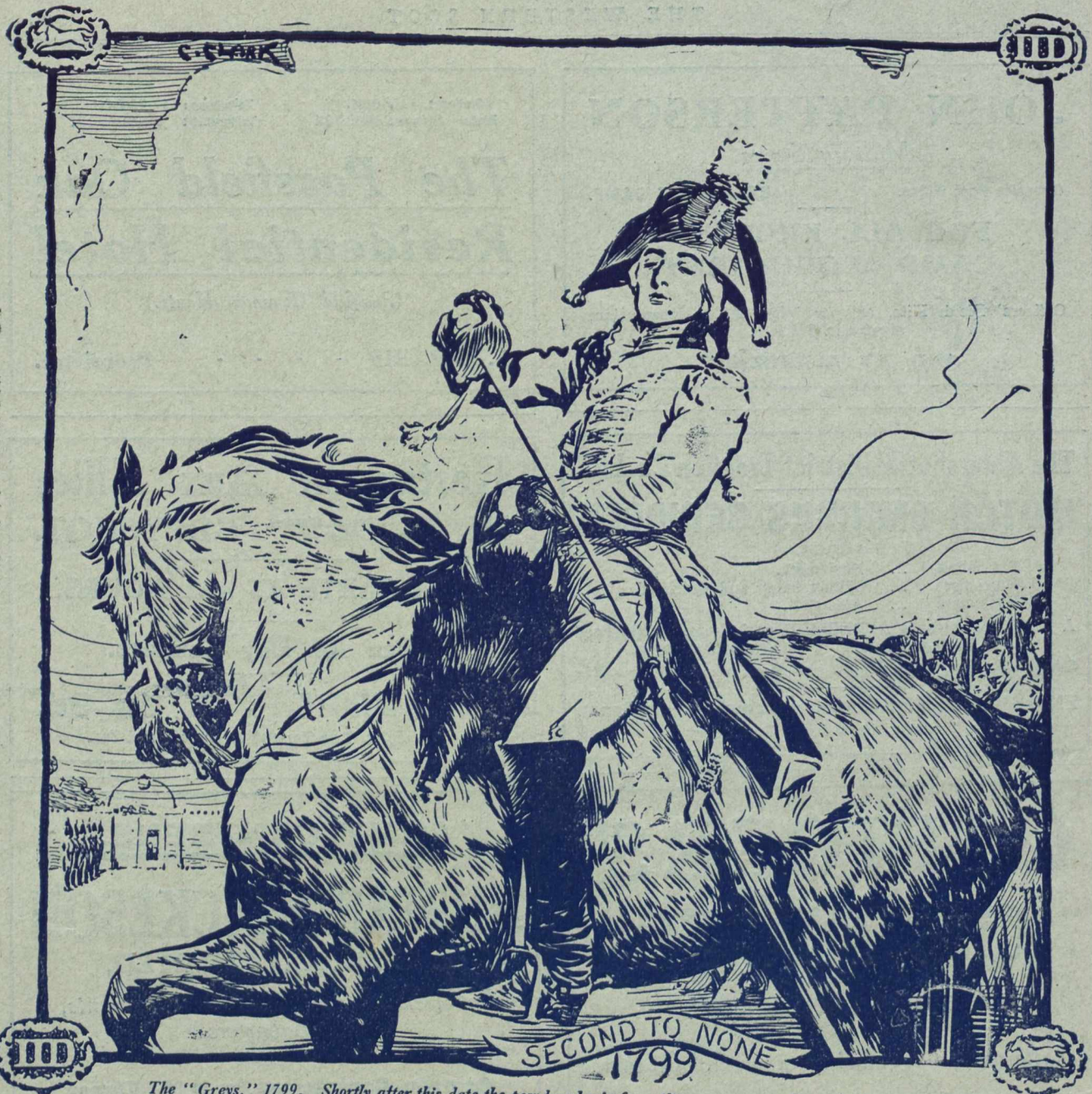
The "Greys," 1799. Shortly after this date the powdered wig for military wear was discarded.