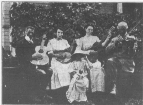
Fun on the Farm—The Swastika Rancho Minstrels

To-day, whatever may annoy, The word for me is joy, just simple joy; The joy of life; The joy of children and of wife; The joy of bright blue skies;