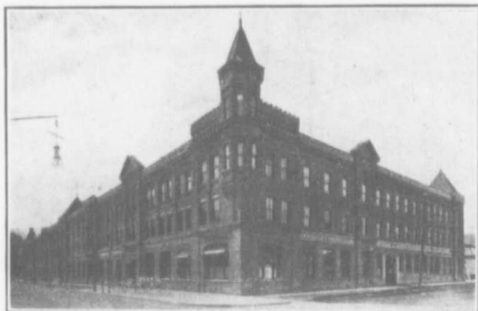
The Wm. Gray-Sons-Campbell, Limited, Carriage Factory

For such branch factories, Chatham is a logical site.