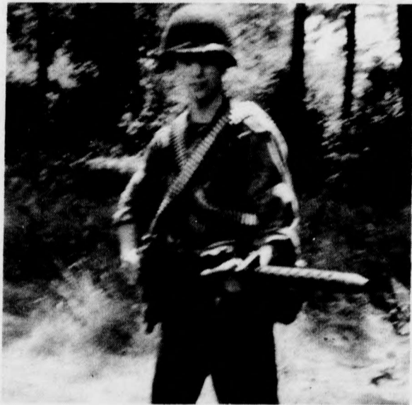
Dis here is de Sarge.

present restricted bombing policy decreases the effect of the air war. Industrial areas, communications, ports, agricultural areas and infiltration routes must be destroyed. Also, the B-52's which are now restricted to targets south of the DMZ would be unleashed upon the North.