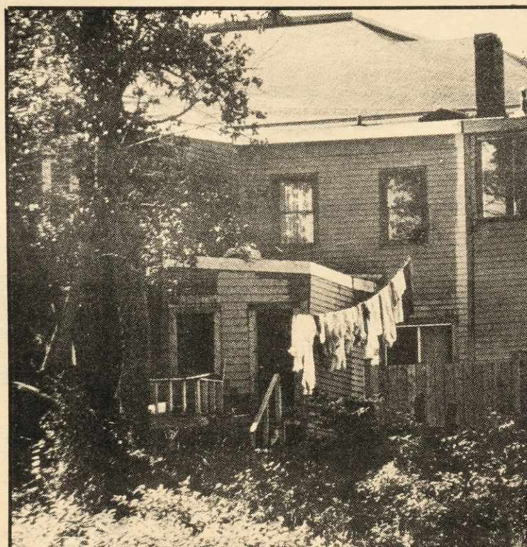
Home sweet home? No society house for Science students for a while. A rederendum to hike students for a house fund squeaked by, but didn't make it through council.

The DSS, as student society, needed DSU council backing before their fee increase went before the Dal Board of Governors for final approval.