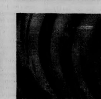
The Tea Party

If you're looking to hear six new songs on this EP, forget it; the only new track is "Time" (featuring Roy Harper on vocals) and it also borrows parts from the bonus track on The Edges of Twilight. Do not despair, however; the five songs the band revamps are excellent, from the hypnotic stic sounds of "The Grand Bazaar" to the remixed version of "Sister Awake". The new track, "Time," is also amazing. If you want to be introduced to the band's sound, you should probably pick up The Edges of Twilight; but, if you're already addicted to The Tea Party, Alhambra should be