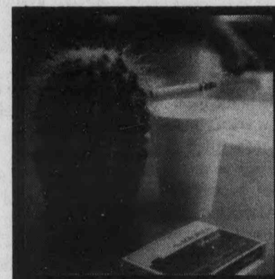
Cactus Bruns II "Masters' of Cool-fu never do stupid things like that!"