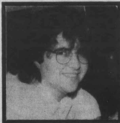
Byron No Degree "Your tooth"