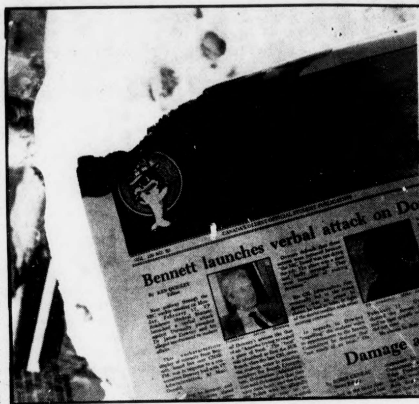
Dramatization of the senseless vandalism.

This driver was new on the job, and unfamiliar with said policy. He arrived at approxmately 5:30 a.m. and left the approximately $500 on prin-