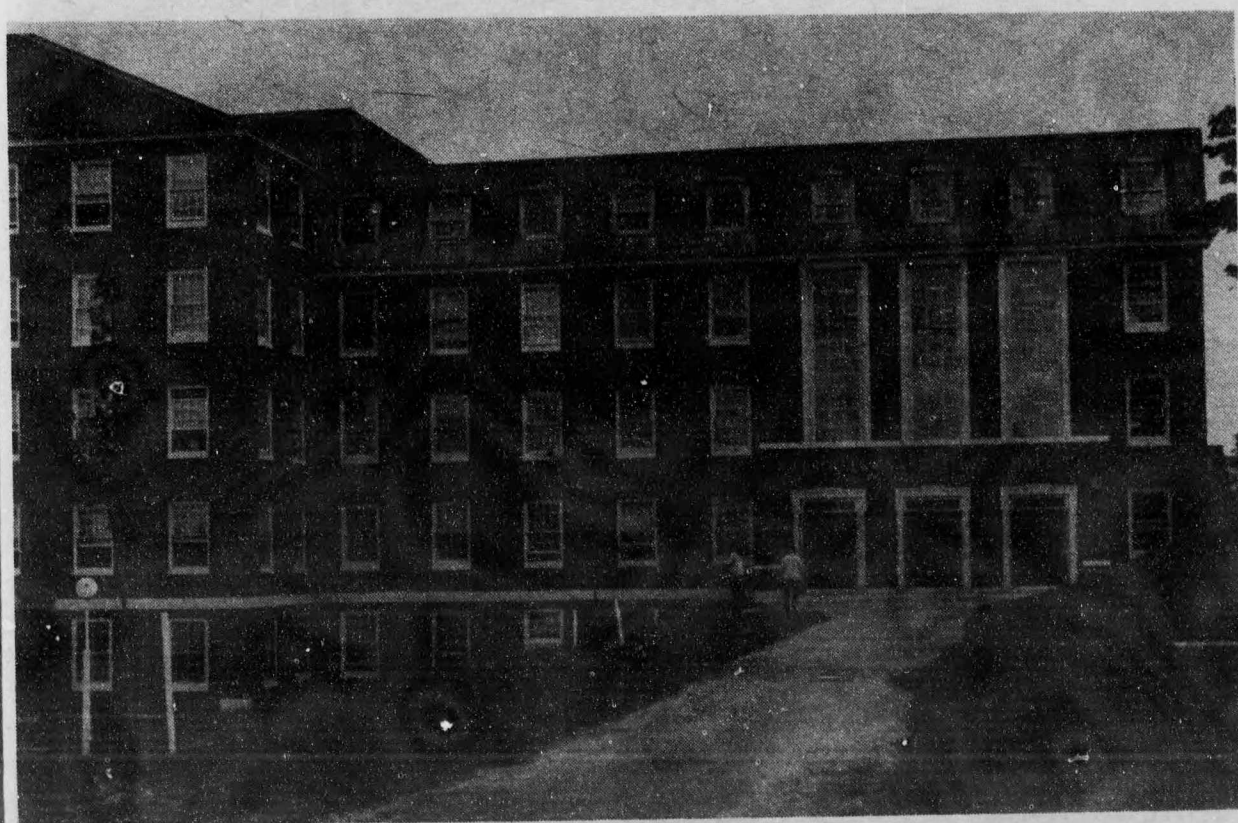
This is Sir Leonard Tilley Hall. It is the Arts Building. If you walk around to the other side of it, the building will be called Thomas Carleton Hall. That, too, is the Arts building. Is Carleton Hall running into Tilley Hall, or is Tilley Hall running into Carleton Hall?