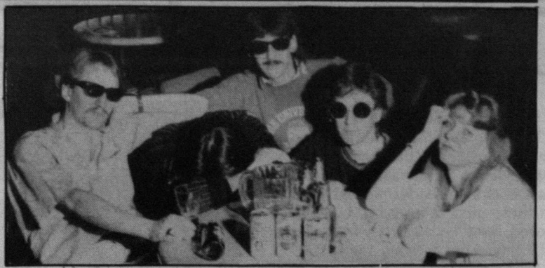
U of A joke slates, such as the popular Apathy '88 Slate, were virtually eliminated from Students' Union campaigns through election rule changes in 1988.