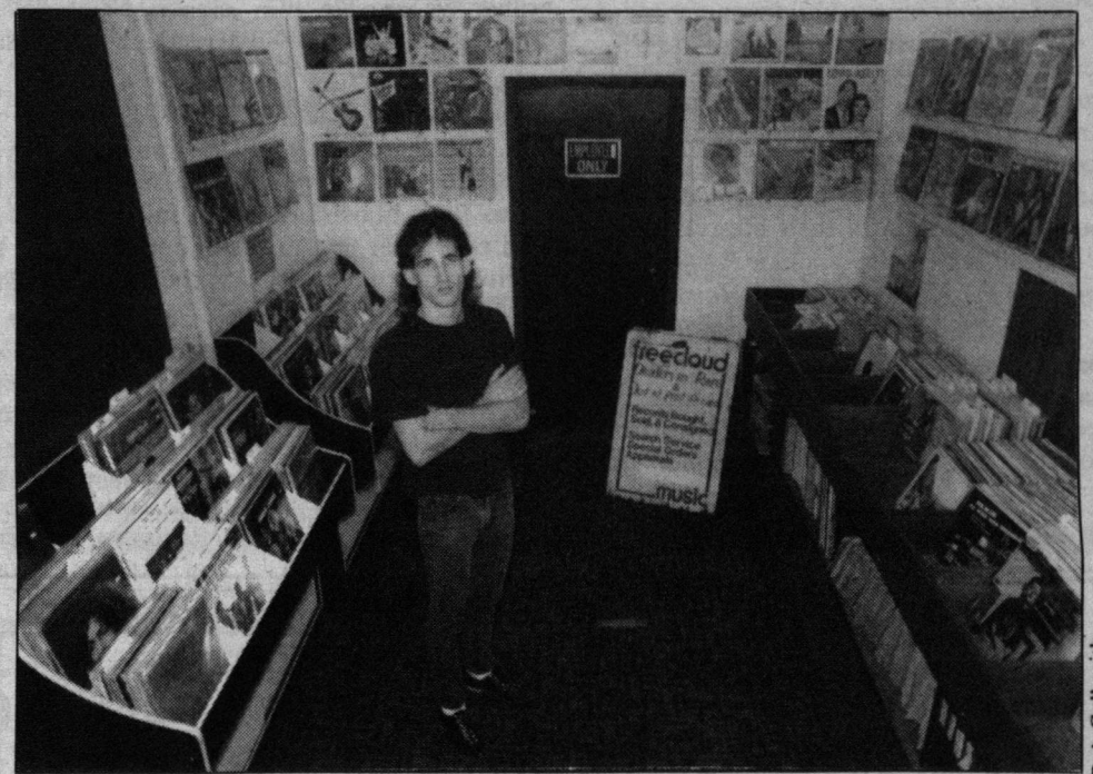
The interior of Freecloud; specializing in vintage '50s and '60s pressings, they are one of Edmonton's most interesting record stores.