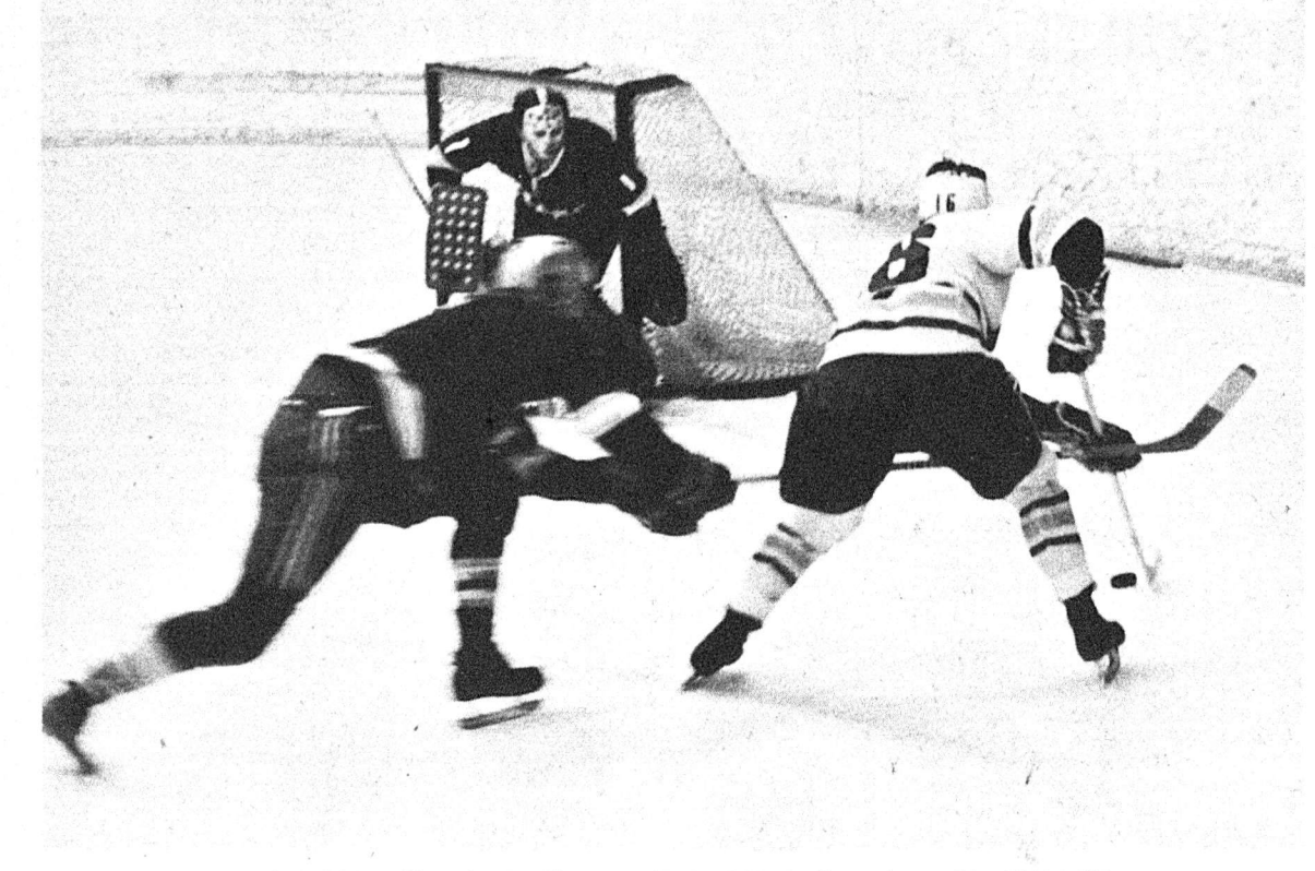
DINOSAURS' DAVE SMITH (16) CUTS IN ON BOB WOLFE ... will scene be repeated Friday night?