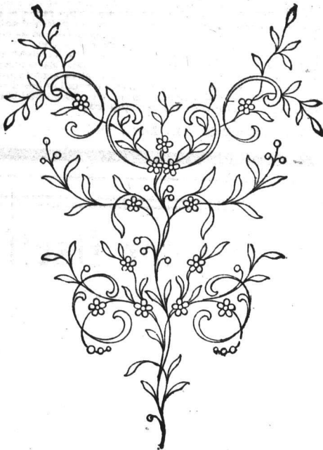
No. 10 Shirtwaist Pattern.

This cut is a small reproduction of an embroidery pattern 10x15 inches. On receipt of 10 cents we will send the large design by mail to any address. The pattern may be transferred to any material for embroidering by simply following the directions given below.