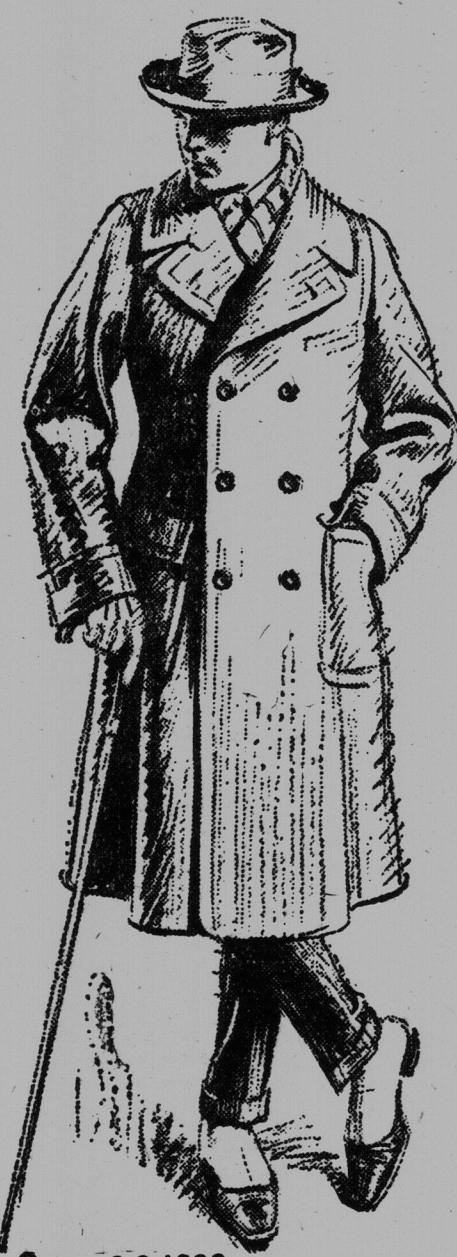
© A. D. & C. 1920 Society Brand Clothes

They are for men who stay young because staying young consists largely of retaining the confidence and alertness of youth even after age has swept away the self-consciousness of youth.