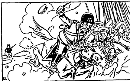
In front of the enemy at Mukden.

rowed from England, of conducting a model flat in connection with the public school. The model apartment in New York is located in the centre of the Russian Jewish district. There is a passionate genius for home-making inherent in the heart of the Jewish race. The flat has been productive of much good at a small expense. The children are taught how to furnish a flat cheaply and