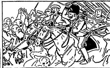
In front of the enemy in Moscow.