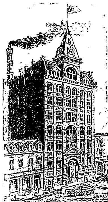
Our New Warehouse & Factory, Montreal (60,000 Square Feet of Floor Room)