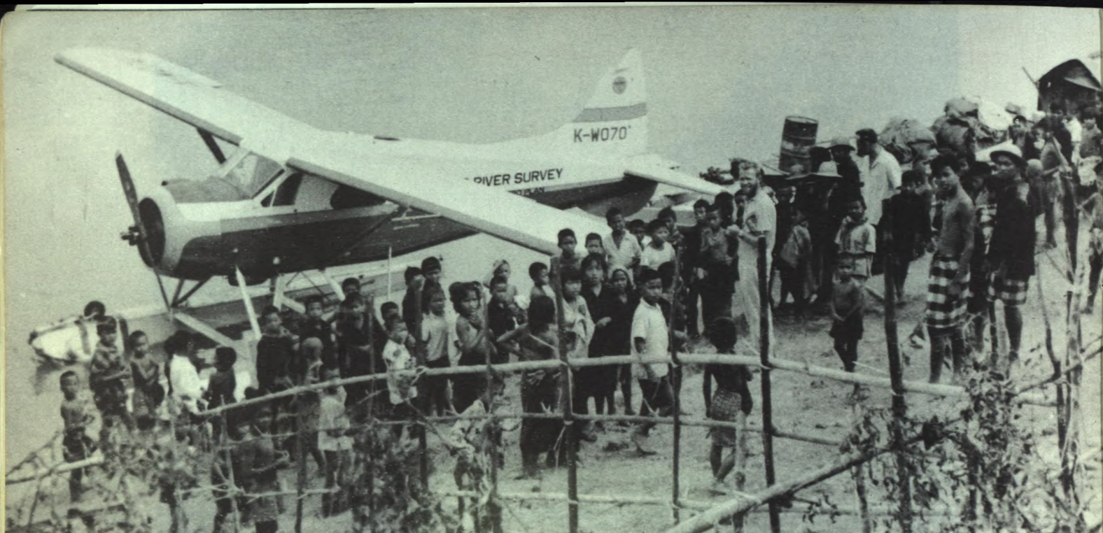
Mekong River Project—A Canadian survey aircraft at a riverside camp.

One of the keys to the development of both agriculture and industry in South and South-East Asia is power, which means oil, coal, hydro-electricity or, perhaps ultimately, atomic energy. The region has considerable oil and coal in some areas and good sources of hydro-electric power in others which can be developed. Another key to economic progress is adequate transportation, which is closely linked with fuel and power. Great expansion of road, rail, sea and air transport facilities is needed to move food, raw materials and manufactured goods within the area and also to handle increased exports and imports.