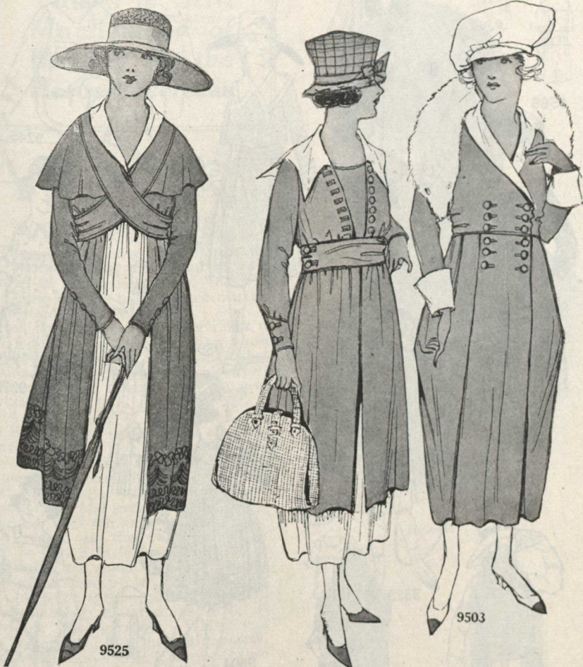
No. 9525. Dress with Tunic for Misses and Small Women, 16 and 18 years.

This is one of the prettiest possible dresses for the young girl and for the small woman of girlish figure, and it can be treated in a variety of ways. In the illustration, broadcloth that is braided with soutache is combined with satin to be extremely attractive, but you could make this dress all of the broadcloth, all of serge, or all of charmeuse or other satin. If you have a two-piece skirt from last season that is made of silk or of satin or of serge, and you want to utilize it, you could not do better than to use it for the foundation of this dress and make the tunic and bodice of a different material. This year, there are so many combinations of materials and even combinations of color that it is easy to remake without the annoying problem of matching. Blue is beautiful with black and with sand color and with the new shade known as Democracy, and you could combine brown with sand or brown with tan color. The little cape that is attached to the surplice closing makes a very novel and a smart feature. For the 16-year size will be needed, 3 1/2 yards of material 44 inches wide for the bodice and tunic, 2 3/4 yards for the skirt and trimming. Price 15 cents.