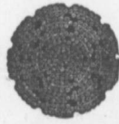
Lay or ordinary Patent Flattened Strand Winding or Hauling. Patent Flattened Strand, (non spinning)

DRAWERS OF all Sections STEEL-WIRE. HIGH CLASS for Ropes, Springs, Pianos, Needles, Fish-Hooks Binding Armatures and all other Purposes.