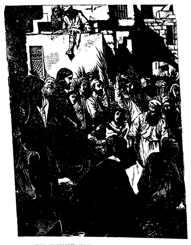
THE TRIUMPHANT ENTRY .- THE PALM BEARERS.

anxiously, as visions of a young man starving himself on dry crusts and run-North. ning an unlimited number of miles daily,