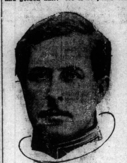
KING ALBERT OF BELGIUM

A Great Athlete There are few things that this accomplished king could do or hasn't done. He fights, rides, swims, shoots, and engages in aviation, engineering and writing with equal facility. He was a newspaperman for a long time, carrying a police card, visiting police stations and doing what is known as "ship news." As a reporter, it is said, he was a "snappy" worker, who scored many beats and obtained timely pictures. King Albert is more than six feet in height and has a fair complexion and golden hair. He is 39 years old,