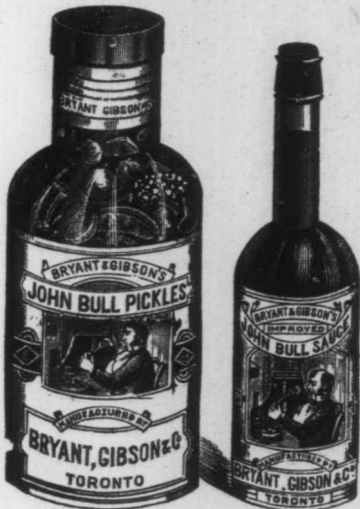
This is a facsimile of our bottles.

"Worcestershire Sauce," "Yorkshire Sauce" "Devonshire Relish" Raspberry Vinegar, Eva- porated Vegetables, Chocolates, Coconuts, Confectionery.