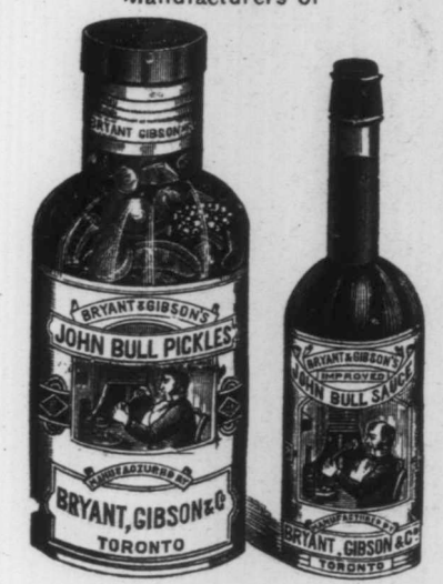
This is a facsimile of our bottles.

"Worcestershire Sauce," "Yorkshire Sauce," "Devonshire Relish" Raspberry Vinegar, Evaporated Vegetables, Chocolates, Cocoas, Confectionery.