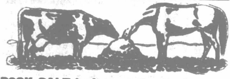
ROCK SALT for horses and cattle, in ton and car lots. Toronto Salt Works, Toronto

The Sharples Separator Co. West Chester, Pa. Toronto, Can. Chicago, Ill.