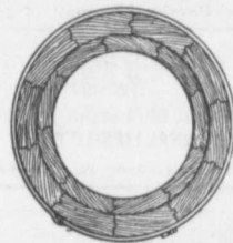
End view of Pipe and Coupling.