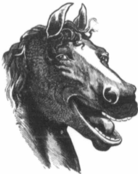
"My Boss has the SUCCESS Spreader"

Frame Made Entirely of Hard Wood—Not Pine.