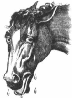
"My Boss has the other fellers"