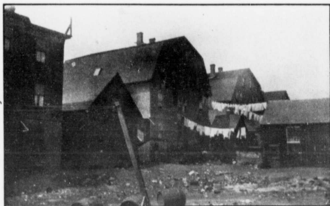
A view from Ferry Street. A section of the tenement district. Note condition of the yard.