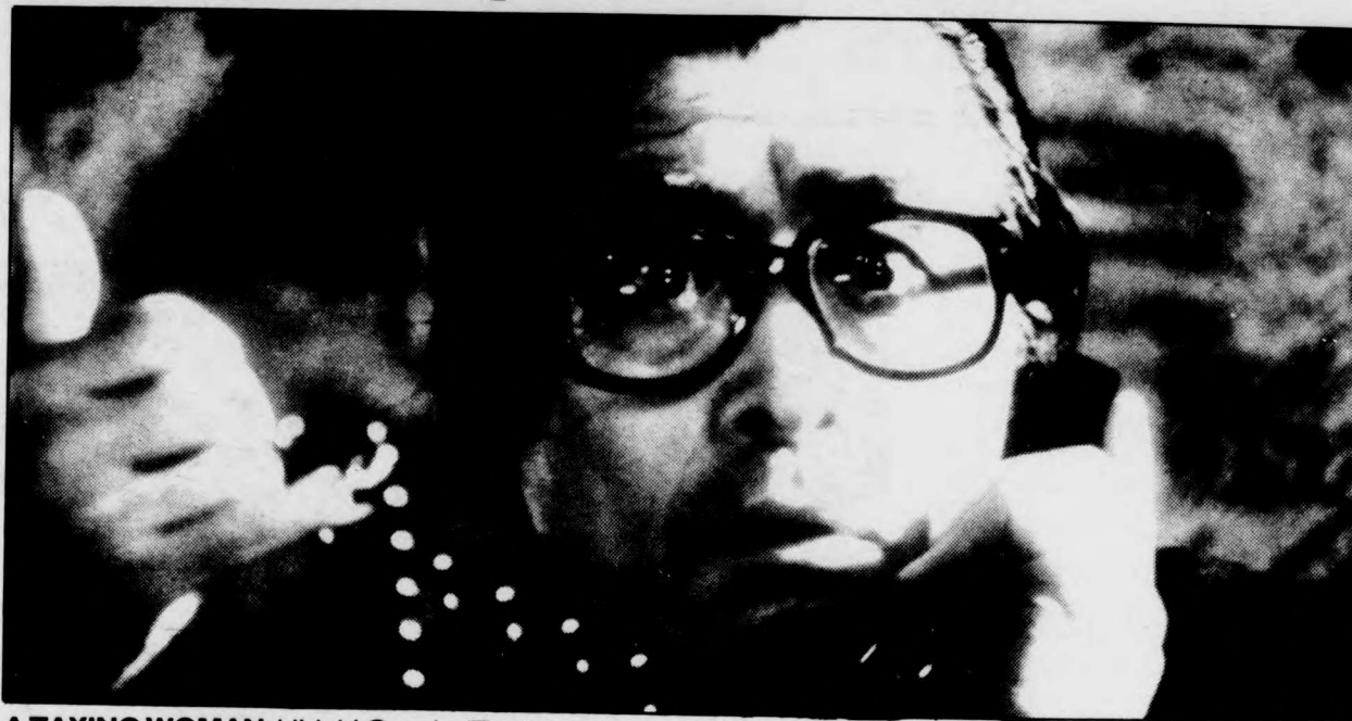
A TAXING WOMAN: Hideki Gondo (Tsutomu Yamazaki) is worried because he can't hide his secrets from the taxing woman forever.

Although viewers can identify with the characters, there are no heroes or villains to cheer or boo in this movie.