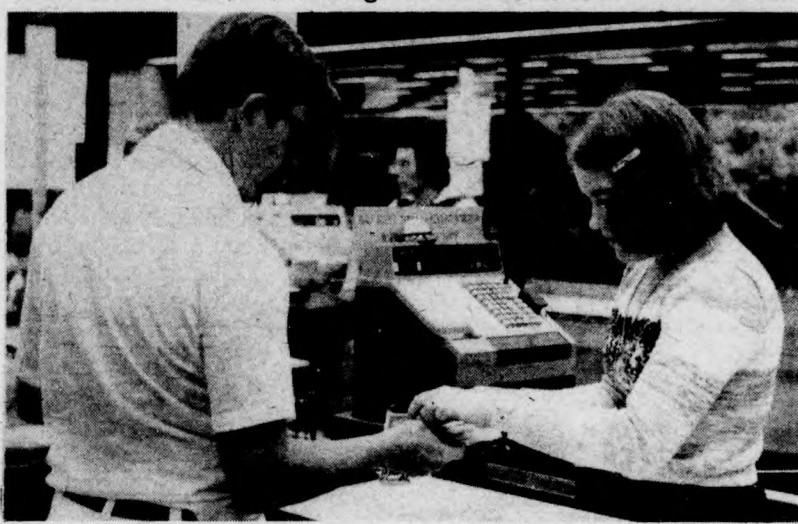
York student exchanges a large portion of his savings for a few books.

This is often due to the publishers. not to the staff of the bookstore, for the cost of the book to the consumer includes many hidden additions. In many cases the price of shipping, handling, paperwork, customs