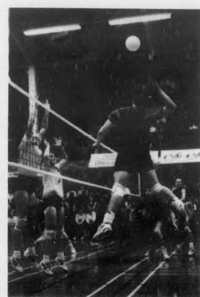
Volleyballer's spike the competition at AUAAs

This set the table for a final matchup which most observers believed would prove to be as one sided as the Super Bowl. Somebody forgot to hand the capturing the first game, squandering a 16-14 lead. After losing the second game in embarrassing fashion, they then out-