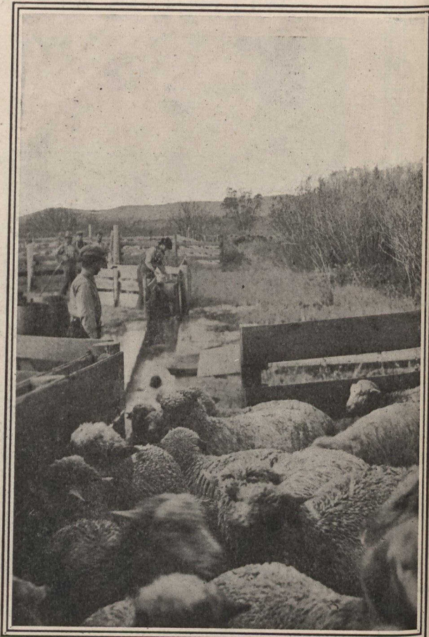
Dipping Sheep.—The far man is about to throw one into the long narrow Vat. The near man pulls them out.