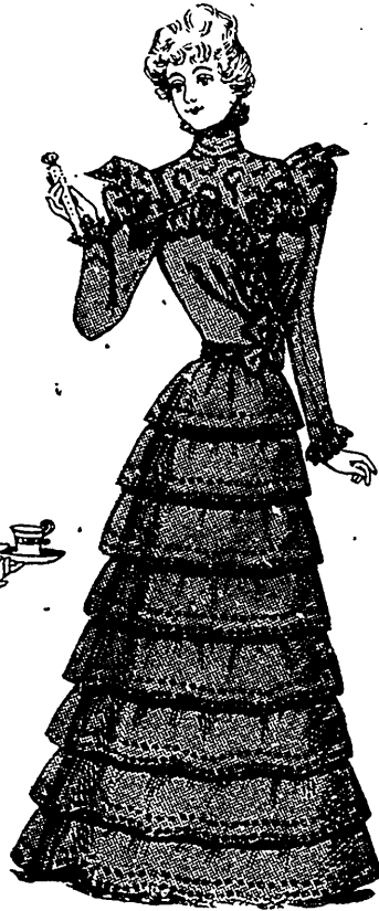
FIGURE No. 38 X.—LADIES' AFTERNOON RECEPTION TOILETTE. —(Cut by Skirt Pattern No. 9875; 7 sizes, 20 to 32 inches, waist measure; price 1s. or 25 cents; and Basque-Waist Pattern No. 9826; 9 sizes; 30 to 46 inches, bust measure; price 10d. or 20 cents.)

One of the handsomest tucked vests that can be devised is shaped by pattern No. 9788, which is in seven sizes for ladies from thirty-four to forty-two inches bust measure, and costs 7d. or 15 cents. Taffeta silk is used in this instance for the vest, and lace