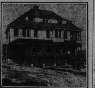
GRENFELL MISSION HOSPITAL. On Hospital Island, Labrador.