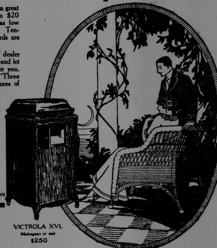
VICTROLA XVI Singer or talk $250