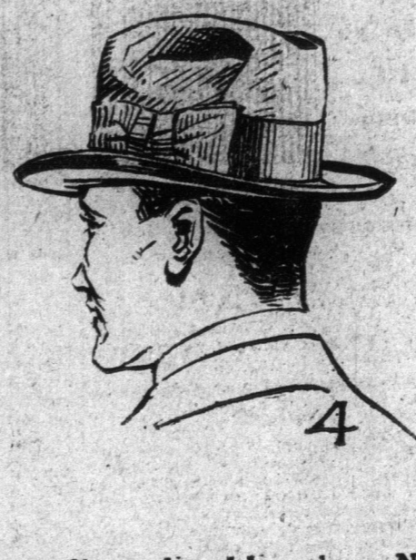
No. 4—Shows the celebrated "Borsalino," an Italian-made hat of beautiful quality felt. It features the wide flaring brim and is obtainable in dark or daga green. Price . . 4.50