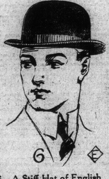
No. 6—A Stiff Hat of English make to suit the conservative dresser, has medium crown and flat-set rolling brim; lined with white silk. This hat is self-conforming and will fit the head comfortably from the start. Each . . . . . 2.50 —Main Floor, James Street.

To the Motorist we Recommend Capeskin Gauntlet Gloves at $3.50 Pair