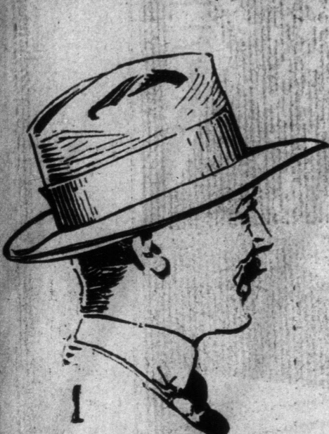
No. 1—The Sphinx Hat is specially made for us by one of the best American makers—fedora style, with flat set brim, 2 1/2 inches wide, with binding on edge. Myrtle green. Price . . . . . 3.00

WE illustrate a few styles from the great array which includes such well-known English and American makes as Stetson, Crofut and Knapp, Mallory, Christy, Battersby and Moore. The style most favored this season is a fedora with medium high crown and flat brim, about 2 1-2 and 2 5-8 inches wide, with either bound or welted edges, as represented in numbers 1, 3 and 4.