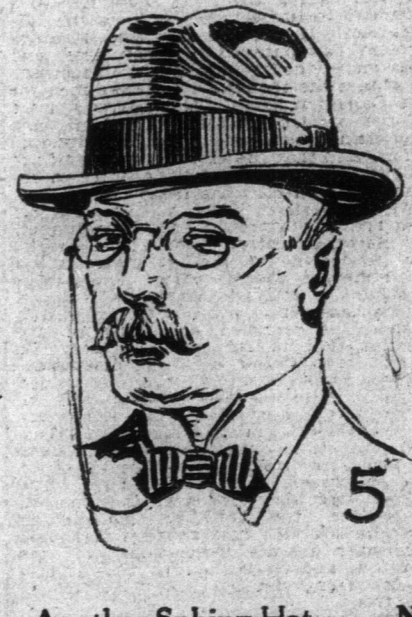
No. 5—Another Sphinx Hat in fedora shape; fairly high crown, with rolling brim wilted on edge. A conservative style, in colors of medium grey with black band. Price. 3.00