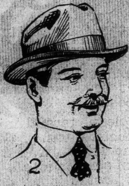
No. 2—A remarkable value at $2.00, the quality of the dye and felt being exceptionally good, considering the advance in price of all materials. In the fedora style, with medium-height crown and brim almost flat set, with pencil edge bound. Laurel green shade. Each . . . . . 2.00