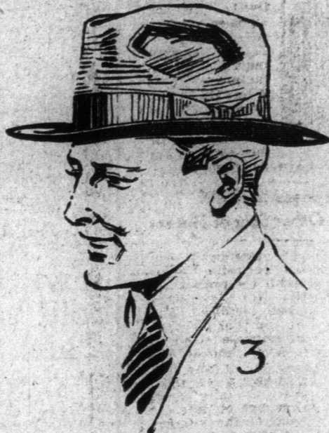
No. 3—Is another Hat specially made for us by a leading American maker, has medium height crown, and nicely proportioned brim, with just a suggestion of roll and narrow binding on edge. Can be worn trooper style if desired. Each . . . . 2.50