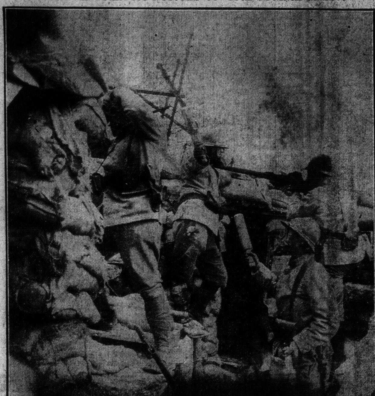
Grenade Fighting in the Combles Region.

vital success. Not only will the lines of the Russians and Roumanians be There was no public reception, but of the Russians and Roumanians be completely linked together, but the danger of Falkenhayn's drive will be eliminated. To the Roumanians the Russians will bring reinforcements that may result in the sweeping of the completely linked together, but the royal travelers were respectfully greeted by a few who recognized them. It is expected that the duke will remain in London for some time, principally in Clarence House. Among those on the platform were: