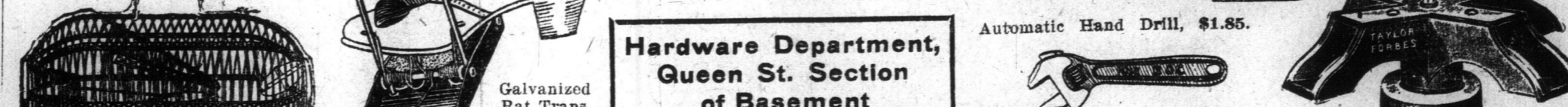
Wire Cage Rat Traps, 65c. Galvanized Rat Traps. Each, 20c.