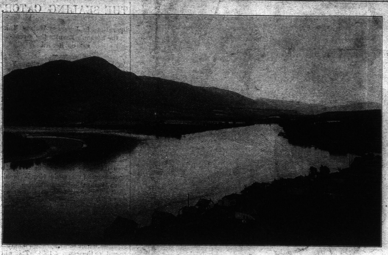
JUNCTION OF NORTH AND SOUTH THOMPSON RIVERS, NEAR KAMLOOPS.